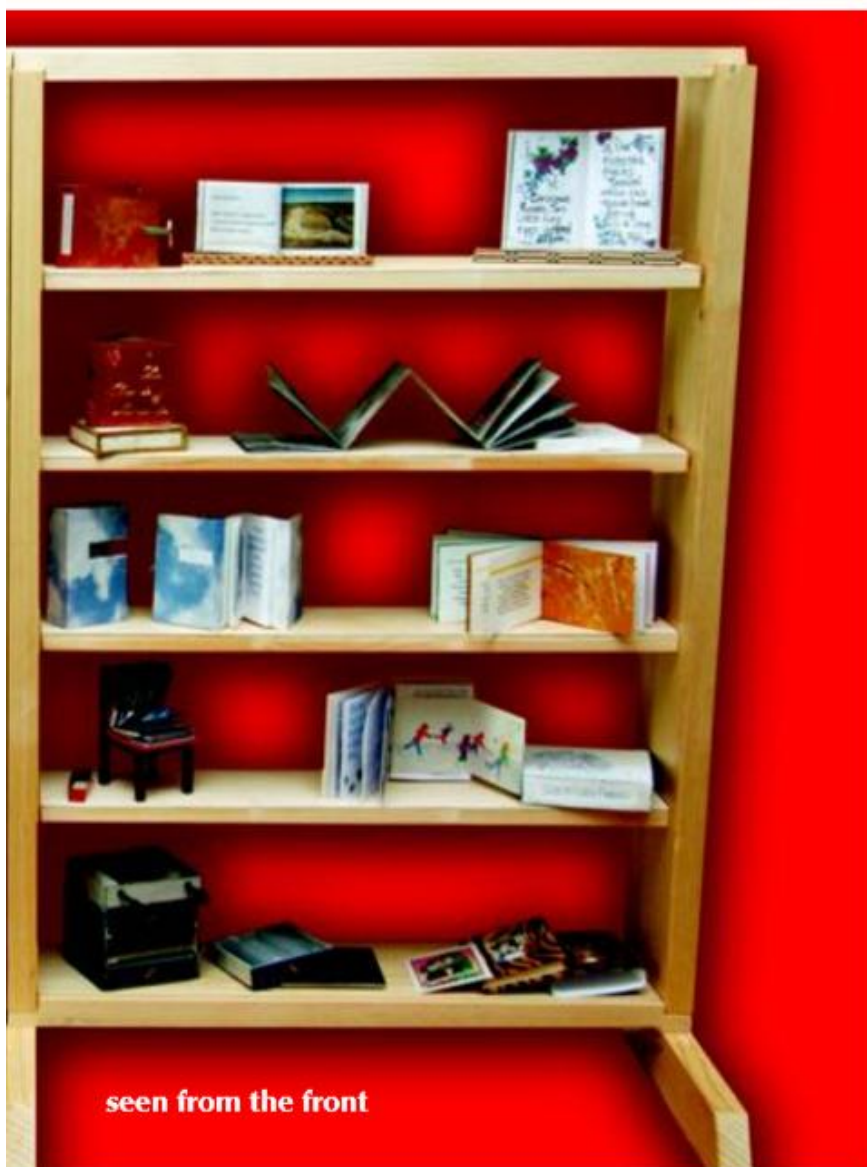
seen from the front