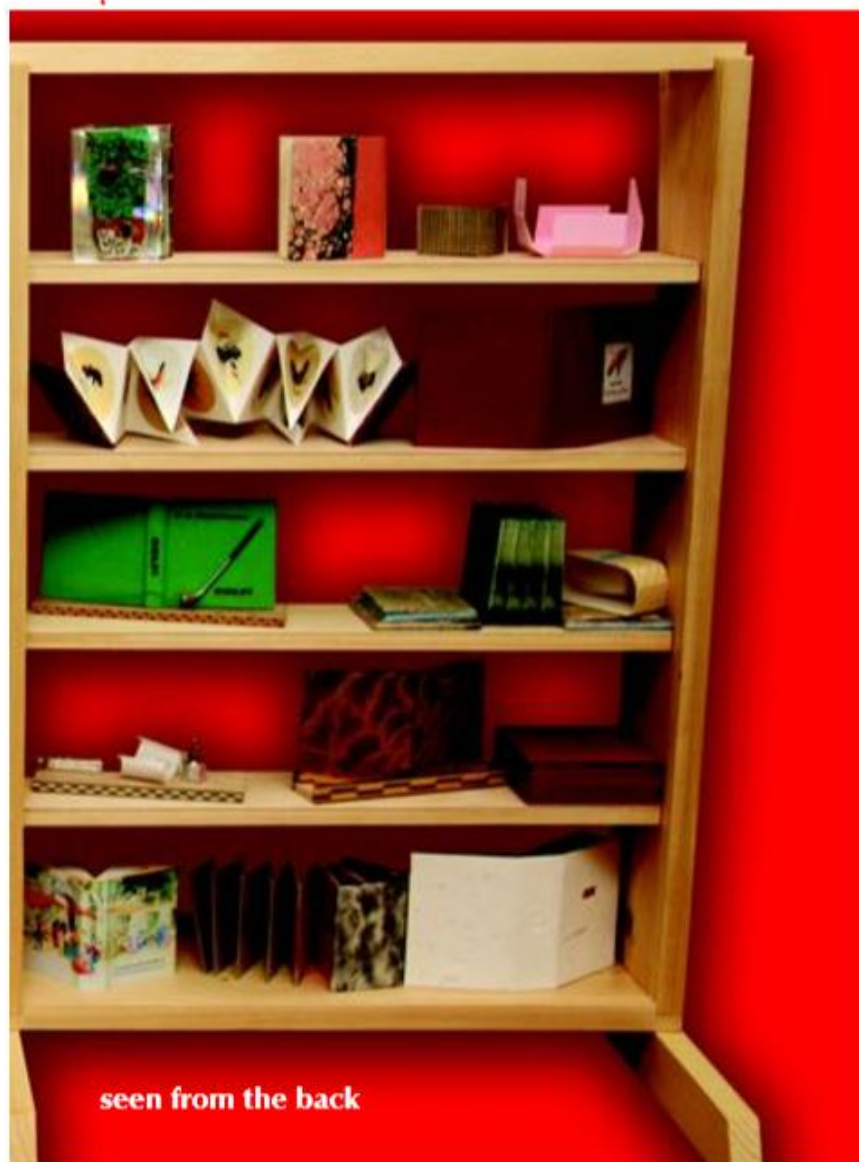
seen from the back