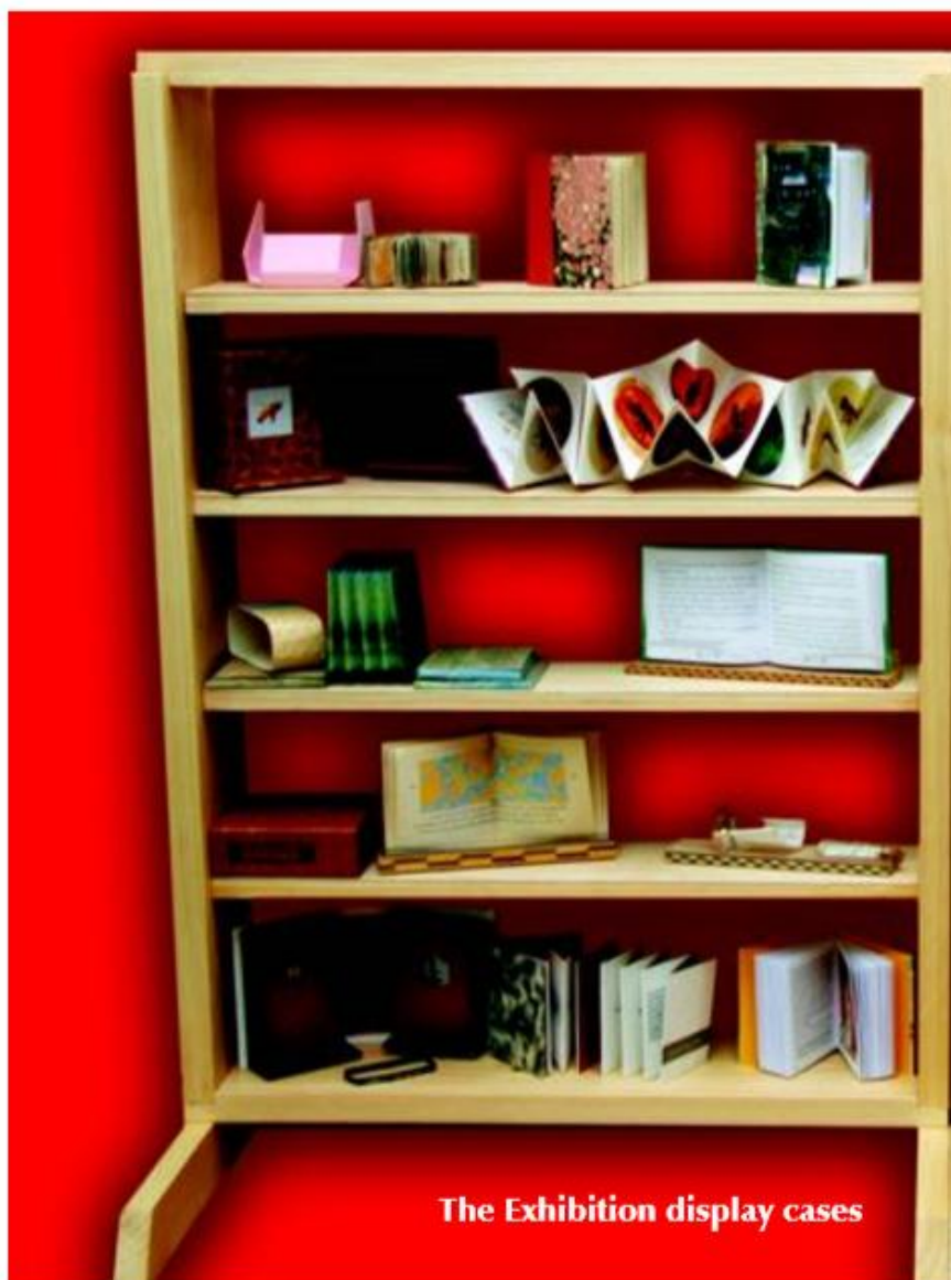
The Exhibition display cases