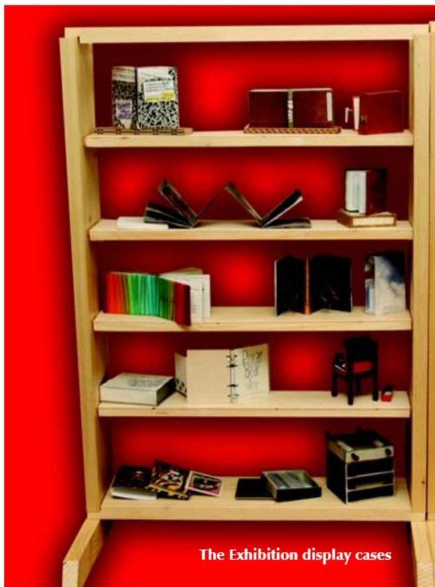
The Exhibition display cases